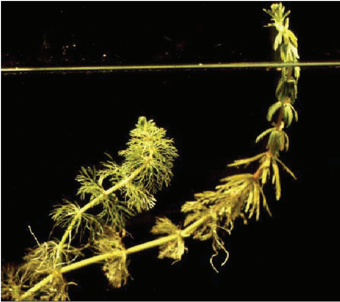
Figure 2. Mature plant, Limnophila , Limnophila sessiliflora (Vahl)

Florida. It is also naturalized in southwestern Georgia and Texas. It was introduced from the Old World.