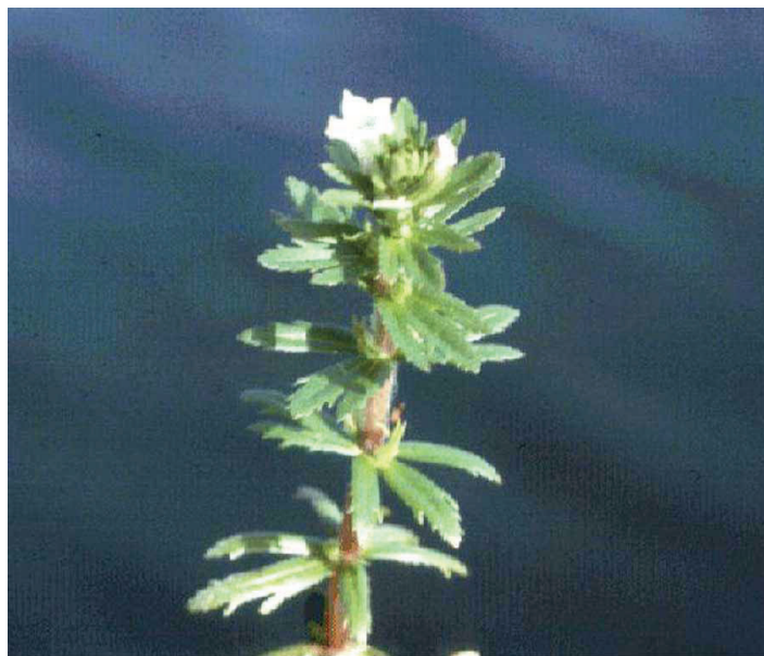
Figure 1. Seedling, Limnophila , Limnophila sessiliflora (Vahl)

Limnophila is an aquatic, or nearly aquatic, perennial herb with two kinds of whorled leaves (Figure 2). The submerged stems are smooth and have leaves to 30 mm long, which are repeatedly dissected. These differ from the emergent stems which are covered with flat shiny hairs and have leaves up to 3 cm long with toothed margins. The emergent stems are usually 2-15 cm above the surface of the water. The flowers are stalkless and borne in the leaf axis. The lower portion (sepals) have five, green, hairy lobes, each 4-5 mm long. The upper portion is purple and composed of five fused petals forming a tube with two lips. The lips have distinct purple lines on the undersides. The fruit is a capsule containing up to 150 seeds.